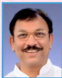
Shri. Sanjayrao Deshmukh

Hon'ble, Member of Parliament, Yavatmal-Washim Constituency.